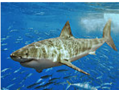
Man surfs on the back of a great white shark