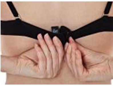
Bras don't actually work, says French study