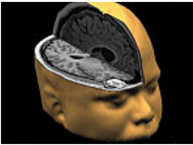
Research shows evidence of mental time travel