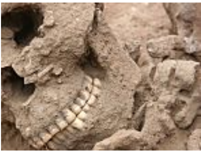
Archaeologists unearth 5,000-year-old 'third- gender' caveman